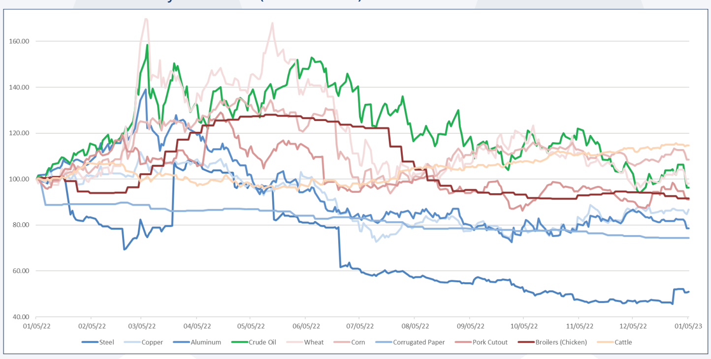
Exhibit 3: Select Relative Commodity Price Trends (Indexed to 100)

Exhibit 3 shows that higher interest rates have reduced demand, leading to a corresponding reduction in many economically sensitive commodity prices such as steel, aluminum, copper, and cardboard (in blue shades). The chart also shows the contrast with price trends for less discretionary items such as oil (in green) and food (in red shades), for which prices have held up better over the past year.